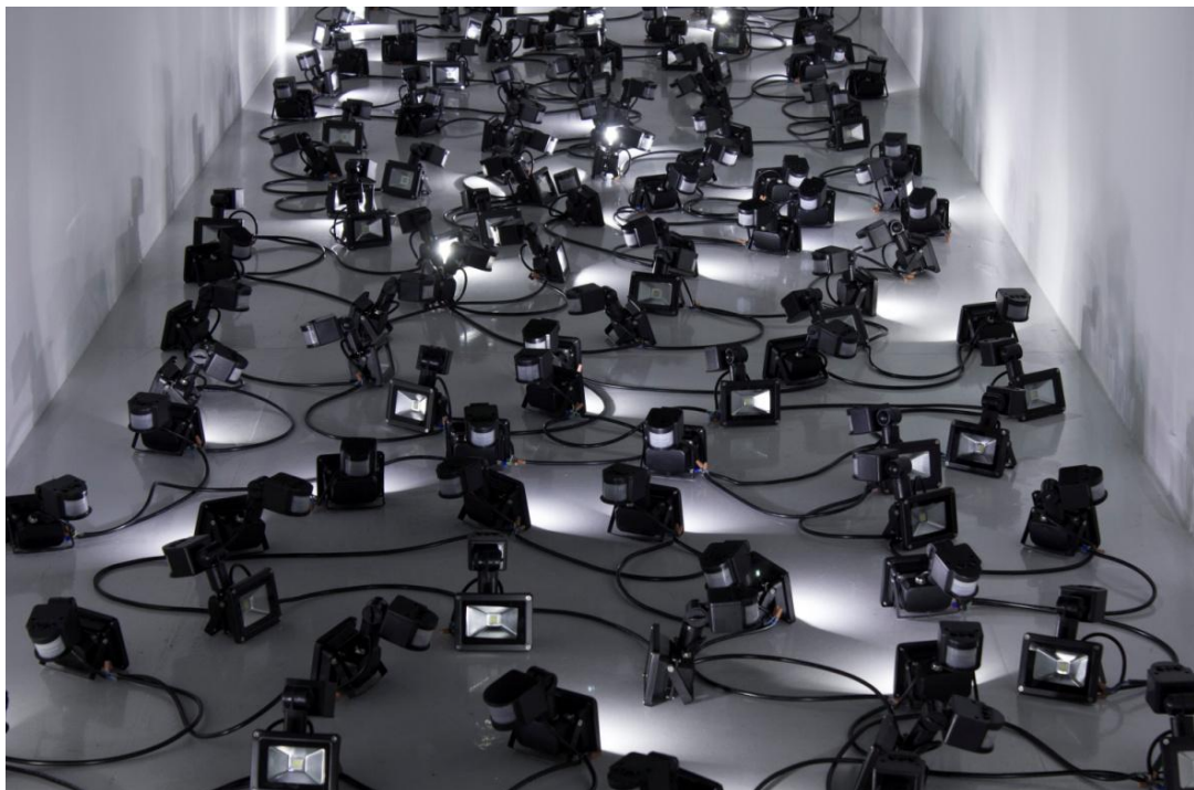
Chris Shen, Exhibition view of Lume (Auto) at Nam June Paik Art Center 1F, Mezzanine

* Artwork: Chris Shen, Lume Field (Auto) 120, 2018, 120 automatic security lights, electrical cable